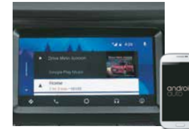
Android Auto Connectivity