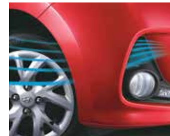
Front Air Curtains