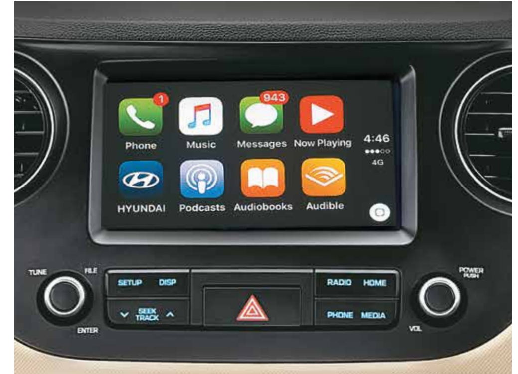
17.64 cm Touch Screen Audio Video System with smartphone connectivity*

The GRAND i10 offers assistive technology at its very best with a class-leading 17.64 cm Touch Screen Audio Video System with smartphone connectivity, voice recognition and navigation support.