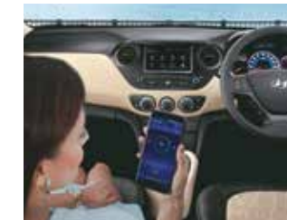
Hyundai iBlue Smart Phone App for Audio Remote Control*