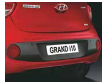
Dual Tone Rear Bumper