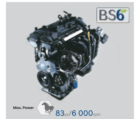
1.2l Kappa Dual VTVT Petrol Engine