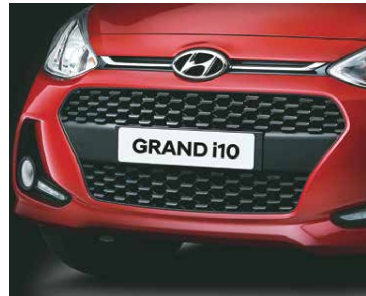
Cascade Design Grille - Bold New Design Identity