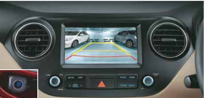
Rear Parking Camera (with display on 17.64 cm Audio Screen)