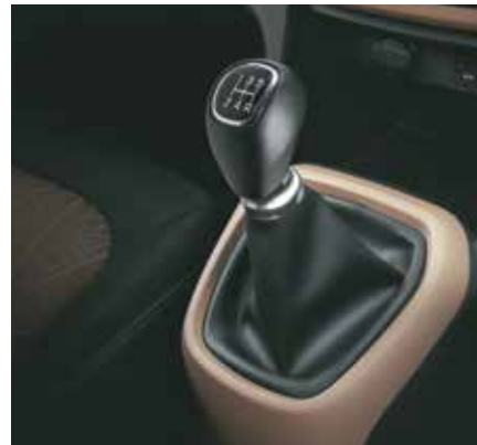
5-speed Manual Transmission

Experience power like never before with the state-of-the-art petrol engine of the GRAND i10.