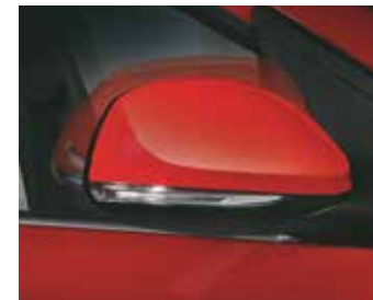
Electric Folding ORVM with Turn Indicators