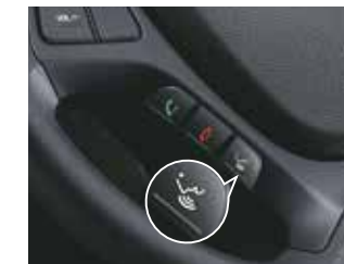
Voice Recognition Button on Steering