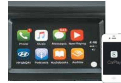
Apple CarPlay Connectivity