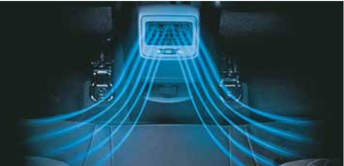
Rear AC Vent with Power Outlet